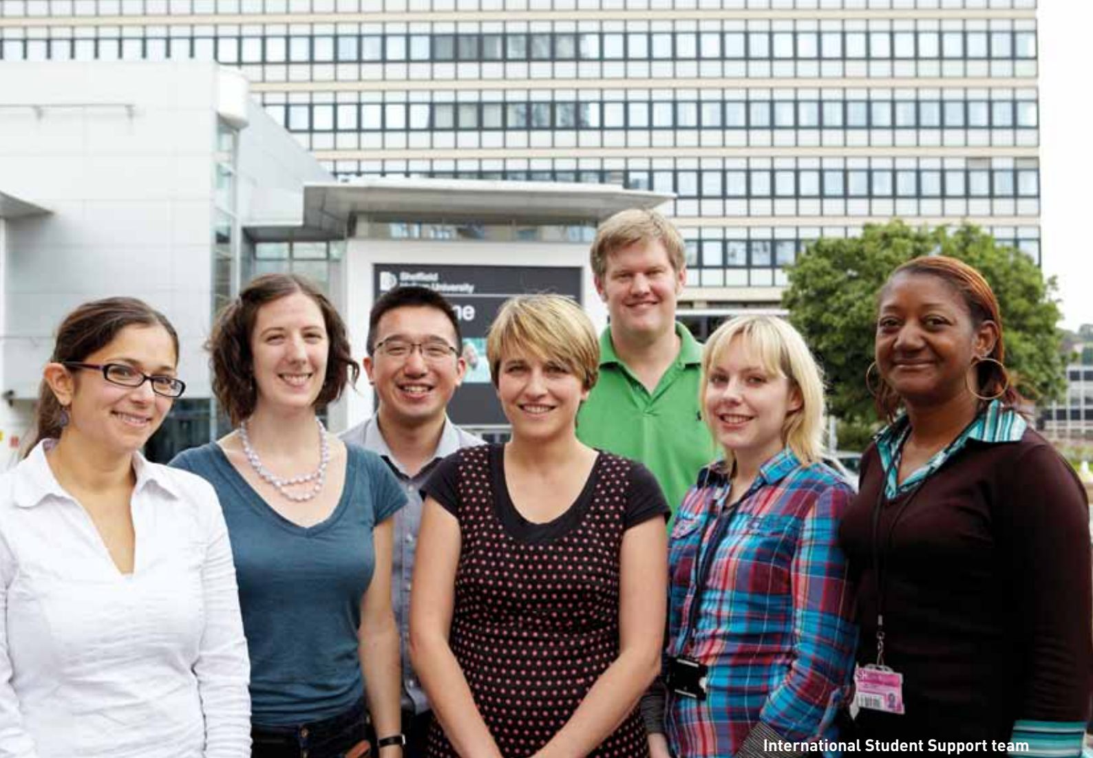
International Student Support team