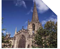
Sheffield Anglican Cathedral