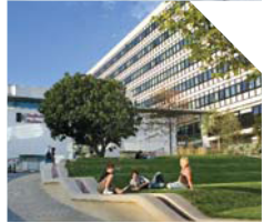
Sheffield Hallam University