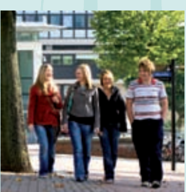
Main entrance, City Campus