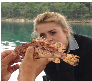
Left: Learning the venomous parts of Scorpaena scrofa