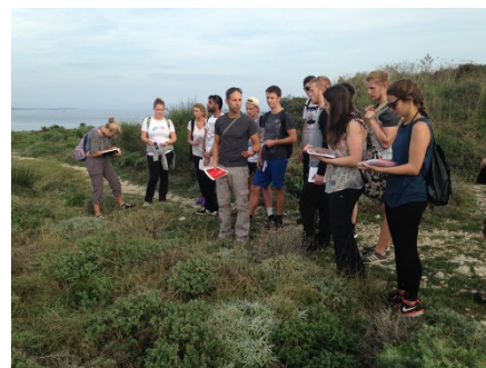
Above: Tour of maquis at Kap Kamenjak