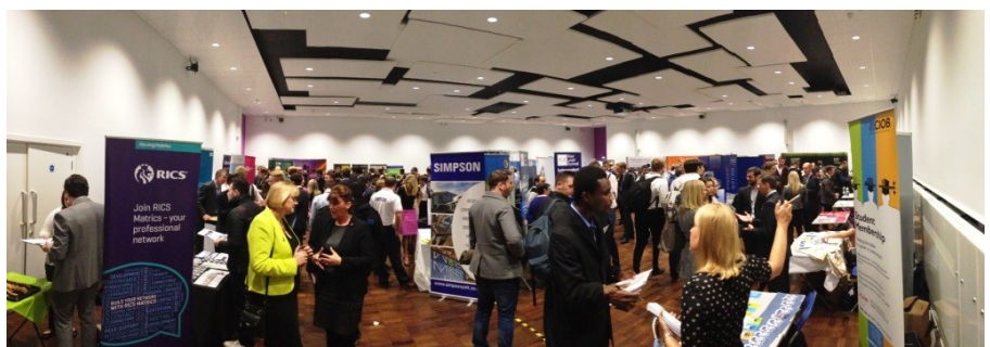
Below: Employers Fair