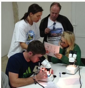
Above: Identifying plankton, collected by trawl.