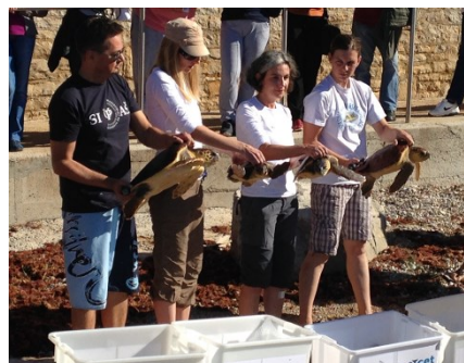
Above: Release of rehabilitated turtles.