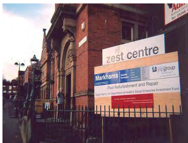
Figure A4.32: The Zest Centre

"We both feel very much at home when we go down to Zest, and it is great that this facility is available, and especially that as pensioners we have been able to participate at a reasonable cost. I admit that if it had been a bit more expensive we might have thought twice about continuing, but it is good value for the money."