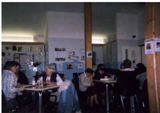
Figure A4.4: Coffee Morning at Trelander and St Clements

Lovely Building always warm and welcoming & clean. My members are happy average 80 each morning and always well looked after by everyone at the centre