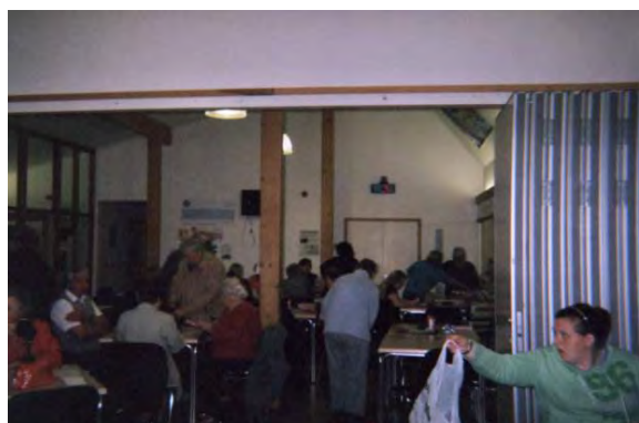
Figure A4.6: Bingo at Trelander and St Clements

The community hall is great! Bingo is fun, meeting all different ages from the estate.