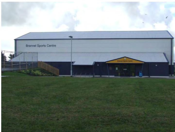
Figure 3.1: Brannel Sports Centre

"This is our sports centre. It's a really nice sports hall. It's warmer and it's got a sprung floor and some of the other schools in the area have concrete floors, there's no give and it's not good for your legs. It's good for netball, good for basketball, good for anything really where you're jumping and moving around." (Pupil and sports centre user, Brannel Sports Centre).