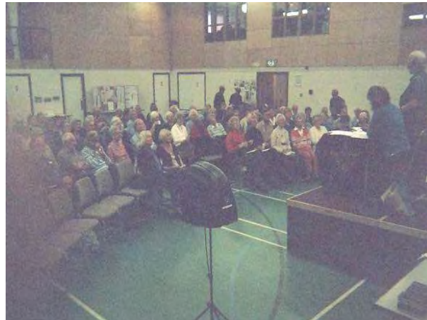
Figure A4.14: The Liskeard branch of the University of the Third Age at Millennium House

Members appreciate the versatility of the centre- they can use the sports hall for large events and smaller rooms for more routine meetings: