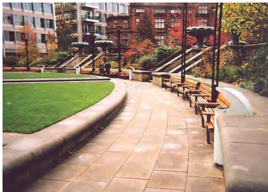
Figure A4.16: Peace Gardens in the Heart of the City

The Peace Gardens are somewhere where I enjoy spending time - eg sitting, thinking or more functionally eating (sandwiches).