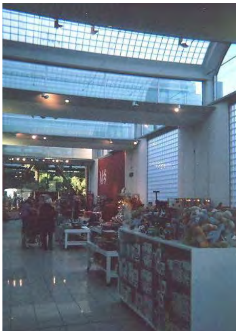
Figure A4.21: Millennium Galleries in the Heart of the City

The Millennium Galleries are amazing & draw you through to the gardens beyond with inspiring pieces.