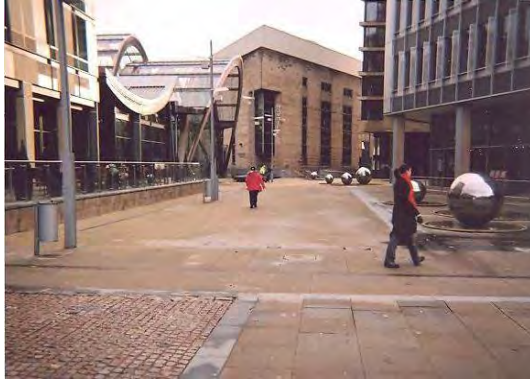
Figure A4.23: Millennium Square in the Heart of the City

"The Millennium Square is a transitory space - I don't spend much time here though use it as a means of getting to/from the Winter Gardens & the Peace Gardens."