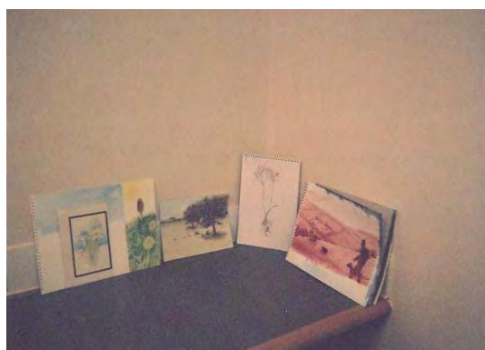
Figure A4.10: Display of art work at Millennium House

Not very clear photo, but some of our current work. We'd like to say how much we enjoy the atmosphere at Millennium House and the facilities, such as the café.