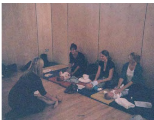
Figure A4.1: Baby Massage Class in Trelander and St Clements

The sports hall is perfect for baby massage as it's clean, private and light. This helps to provide a relaxing atmosphere which is very important for baby massage.