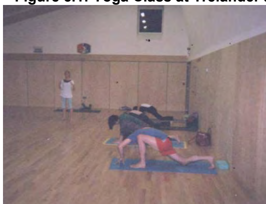
Figure 5.1: Yoga Class at Trelander and St Clements

I love the space it is perfect for yoga.