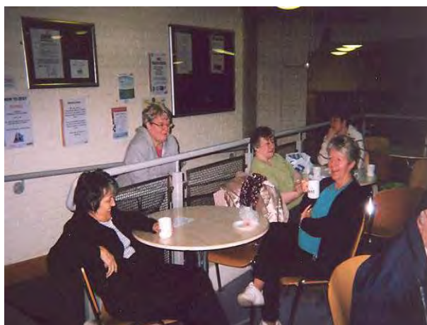
Figure A4.36: Social gathering at the Zest Centre

"The social aspects of going along to the gym at the Zest Centre are very important to me. There's always banter and laughter in the gym and a great atmosphere around the Centre. I live on my own so coming to the gym starts my day off well, it gives me company. It's changed my life really and I'll keep coming."