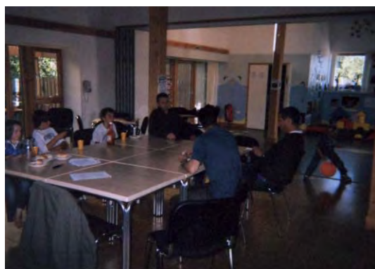
Figure A4.8: Dad's and Kid's Group at Trelander and St Clements

THE CENTRE AT TRELANDER IS WITHOUT DOUBT A SUPERB FACILITY THAT IS PERFECT FOR OUR DADS AND KIDS GROUP. THE SPORTS HALL IS A BRILLIANT ADDITION AND IS ENJOYED BY ALL WHO ATTEND. THE STAFF AT THE CENTRE PROVIDE A FIRST CLASS SERVICE TO US AS SERVICE PROVIDERS IN THE CENTRE.