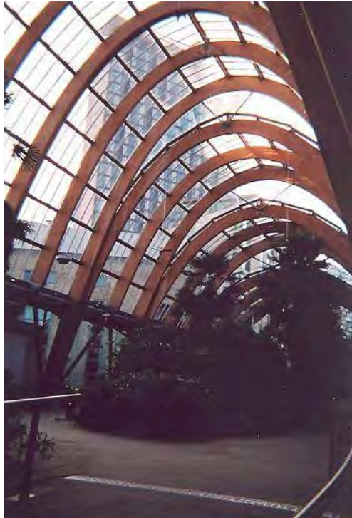
Figure A4.18: Winter Gardens in the Heart of the City

This photo captures the difference, the uniqueness that the Winter Gardens brings. An informal, inclusive space in contrast to the commercial business orientated buildings which surround it.