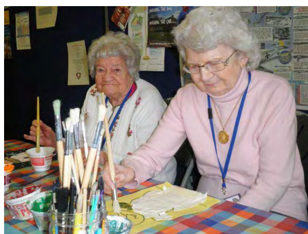
Figure A4.31: Members of The Winning Post Living Centre

"Mum still lives independently and attending the group helps this as she is enjoying herself and being stimulated. She's getting a lot socially from the group and likes the quizzes. It's been a real battle to find somewhere suitable for her and it took about a year to get a place." (Daughter and carer to regular attendee of the Memory Group).