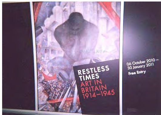
Figure A4.20: Exhibition entrance at the Millennium Galleries in the Heart of the City

This shows the entrance to an exhibition that is about 1914 to 1945. This is a period of history that I am very interested in.