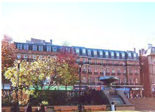
Figure A4.17: Shops opposite the Peace Gardens in the Heart of the City

A peaceful, enclosed space away from the hustle and bustle of the shops where passers by can stop, talk and have a coffee