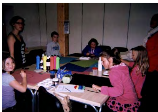
Figure A4.2: Youth Club in Trelander and St Clements

younger group - generic session YP do art, cooking, sports and games, work is done through consultation with YP and then choosing activities as well as workers introducing new ones. equipment has been provided by the centre and it is brilliant for young people to have so many resources.