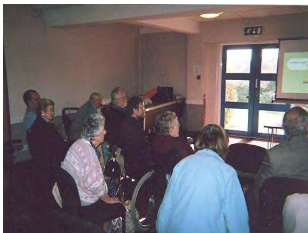
Figure A4.12: The James Parkinson Society (JPS) at Millennium House

The meetings are well attended and group members appreciate the space available at the centre, which allows those using wheelchairs to circulate and chat with ease. The location is central and fairly easily accessible by road and disabled parking is provided in close proximity to the disabled entrance. Group members agreed that it is the most 'disability friendly' venue in the area.