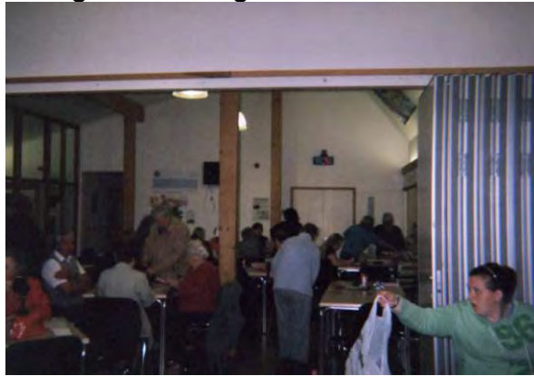
Figure 6.2: Bingo at Trelander and St Clements

The community hall is great! Bingo is fun, meeting all different ages from the estate.