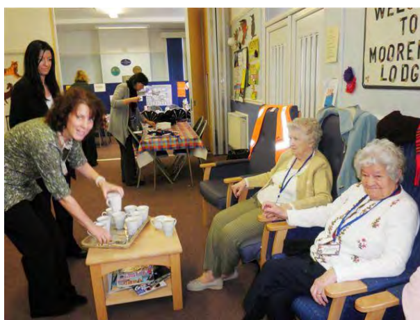
Figure A4.29: The Memory Group at the Winning Post Living Centre

"Mother attends the Memory Group once a week on a Wednesday between 11am and 3pm and has been going for about three years or so. She was referred when her problem got worse. The Winning Post is in the next village about one mile away and mother is collected and dropped off by minibus."