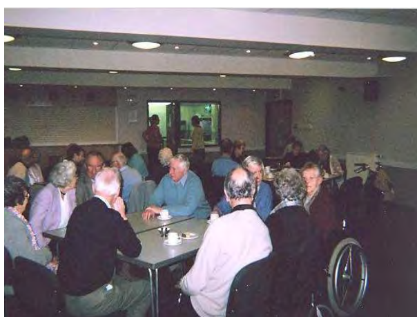
Figure A4.13: Group members at Millennium House

The meetings are well attended and group members appreciate the space available at the centre, which allows those using wheelchairs to circulate and chat with ease. The location is central and fairly easily accessible by road and disabled parking is provided in close proximity to the disabled entrance. Group members agreed that it is the most 'disability friendly' venue in the area.