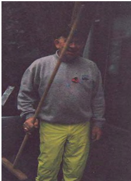
Figure A4.27: Workforce in the Heart of the City

helps to meet the essential work force around the central area