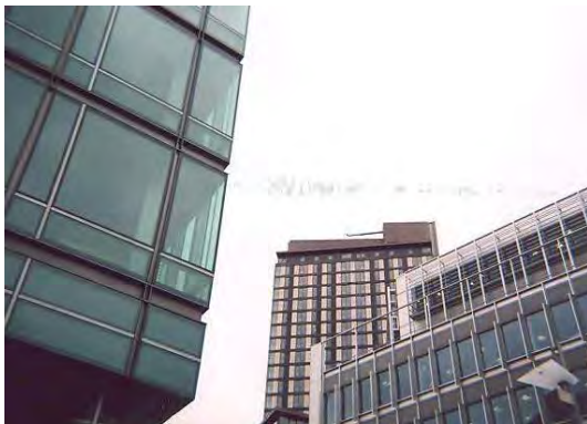
Figure A4.24: Modern architecture in the Heart of the City

Epitomises what's wrong about modern architecture!