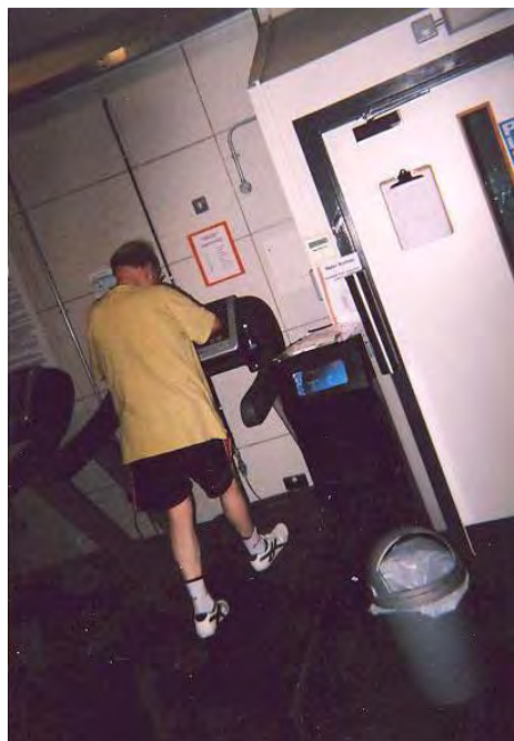
Figure A4.33: Fitness area at the Zest Centre

This gentleman came here after a stroke and his progress has been amazing