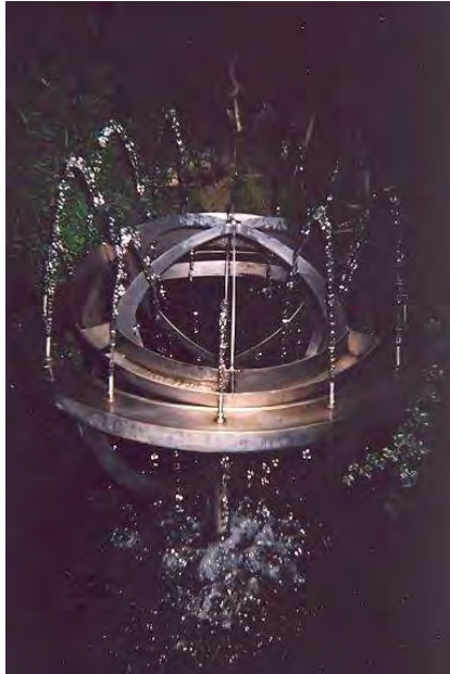
Figure A4.22: Water feature in the Winter Gardens in the Heart of the City

Really like the features in the Winter Gardens, makes visit more enjoyable