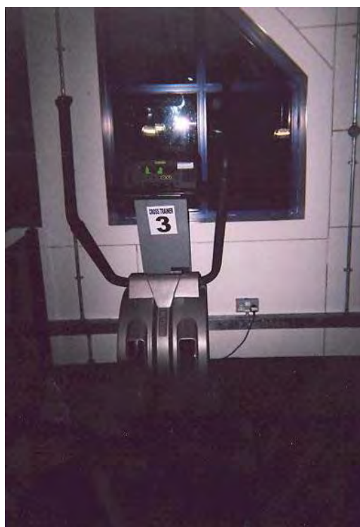
Figure A4.35: Exercise machines at the Zest Centre

The cross trainer I first did two minutes when I first started I now do twenty five minutes now.