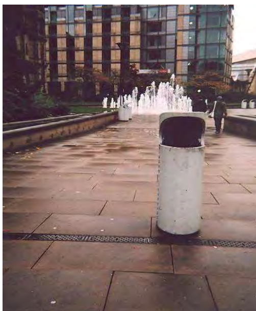
Figure A4.28: Public Investment in the Heart of the City

What would happen if the bins overflowed?