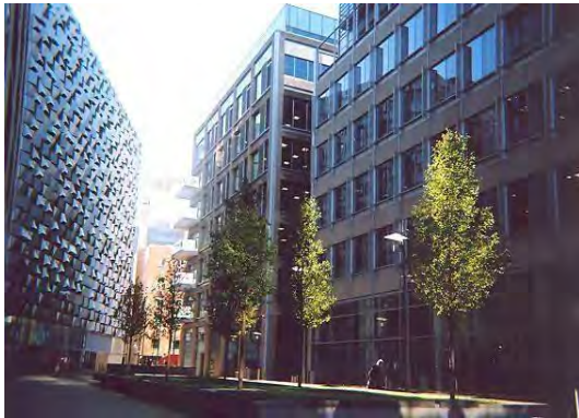
Figure A4.26: Commercial buildings in the Heart of the City

A rather desolate & empty space beside the 3 successful ones. It's a great store enclosed and dark