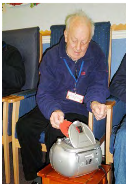
Figure A4.30: Memory group member at The Winning Post Living Centre

"My husband has been attending the Memory group for about a year. He enjoys it because it's his main trip out of the week because it's difficult to get out with him. He likes the company and having somebody to talk to and the dominoes and painting. He's definitely chattier when he comes home. He looks forward to Wednesdays. I would really like it if he could attend on another day too but places are limited." (Wife and carer to regular attendee of the Memory Group).