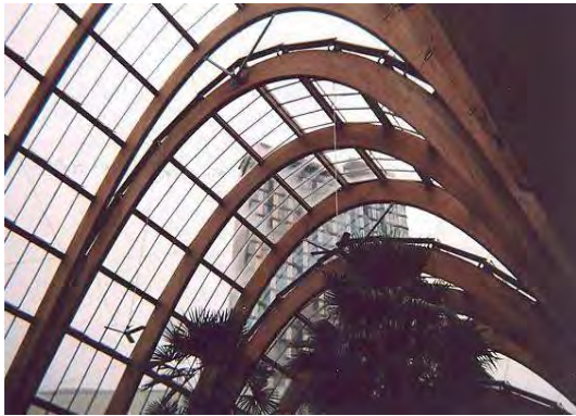
Figure A4.25: Architecture of the Winter Gardens in the Heart of the City

Corporate Sheffield — but I do love to eat lunch there!