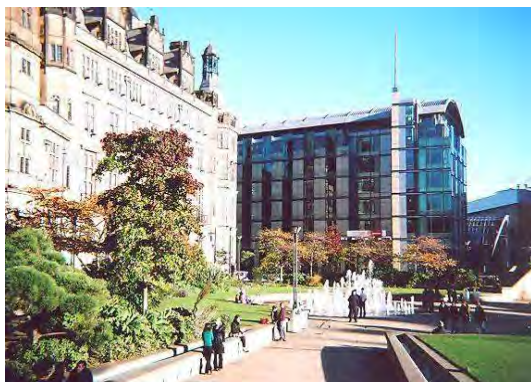
Figure A4.19: Fountains at the Peace Gardens in the Heart of the City

Fountains outside a French Consulate - encourages many activities: relaxation, play or just a slower walking pace to enjoy the view