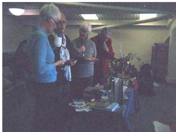
Figure A4.15: Meeting held at Millennium House

Members appreciate the versatility of the centre- they can use the sports hall for large events and smaller rooms for more routine meetings: