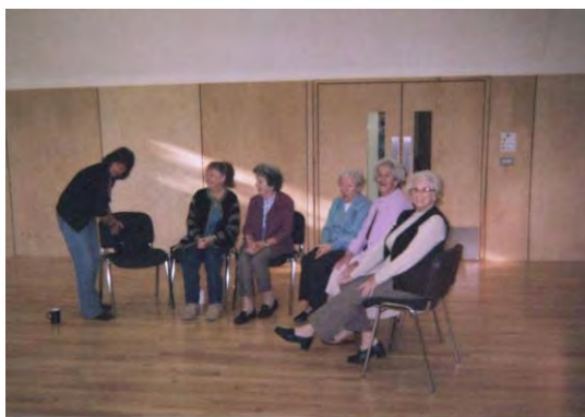
Figure A4.5: Be kind to yourself- keep fit group for the over 55's at Trelander and St Clements:

(Local resident and organiser of coffee mornings)