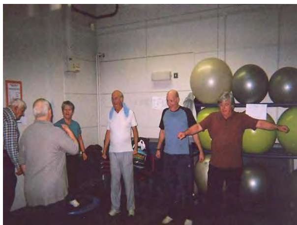
Figure A4.34: Fitness class the Zest Centre

"We have found it very enjoyable, and of great benefit. Until this opportunity came along, ironically only as a consequence of having had a heart attack, I was never much of a one for physical fitness. I used to feel I was too busy working --and claimed that all the running about I did in my job was sufficient exercise. I have been surprised at how much I have enjoyed attending the sessions, and I think that it's largely down to the friendly atmosphere and the fact that we are all, so to speak, roughly of a similar age and have a good instructor. She ensures that we do all the right things, in the right order, and yet at the same time she doesn't expect us to take it too seriously."