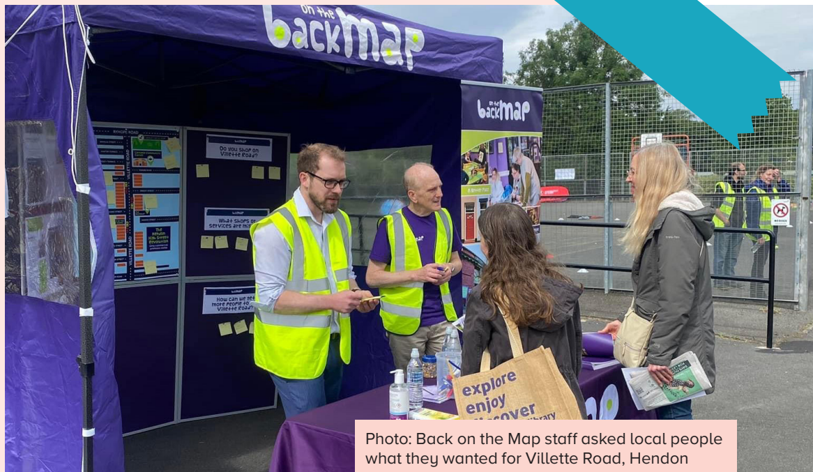
Photo: Back on the Map staff asked local people what they wanted for Villette Road, Hendon

Back on the Map is a well-established community anchor organisation with a 20-year track record, dating back to the New Deal for Communities scheme of the early 2000s. The focus of the CID is Villette Road, a neighbourhood high street that has become run-down and is characterised by a block of properties where the ground floor shops are all closed, although the upper floors are used for residential tenancies. Action has focused on creating a new branding and marketing strategy for the street, bringing together traders and residents, highlighting local heritage, and working with property owners to bring long term vacant units back into use.