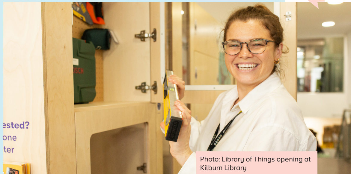
Photo: Library of Things opening at Kilburn Library

Kilburn High Road is also the boundary between the London Boroughs of Camden and Brent (and includes the northernmost point of Westminster). Despite being designated a major town centre with excellent public transport connections and many independent businesses, it's a place of many challenges.