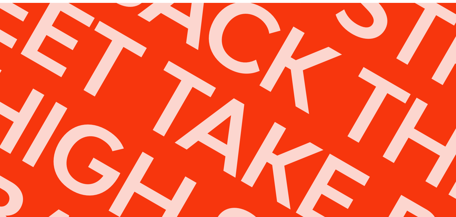
Table 5 below summarises our recommendations, sorted by audience. Further detail is provided in the section.

Our findings and recommendations are set out below. Recommendations are listed in order of primary audience to highlight who, in our view, should do what. The recommendations are addressed specifically to those who might fund and lead CIDs, but the broader principles they contain are more widely applicable to high street regeneration programmes and policies.