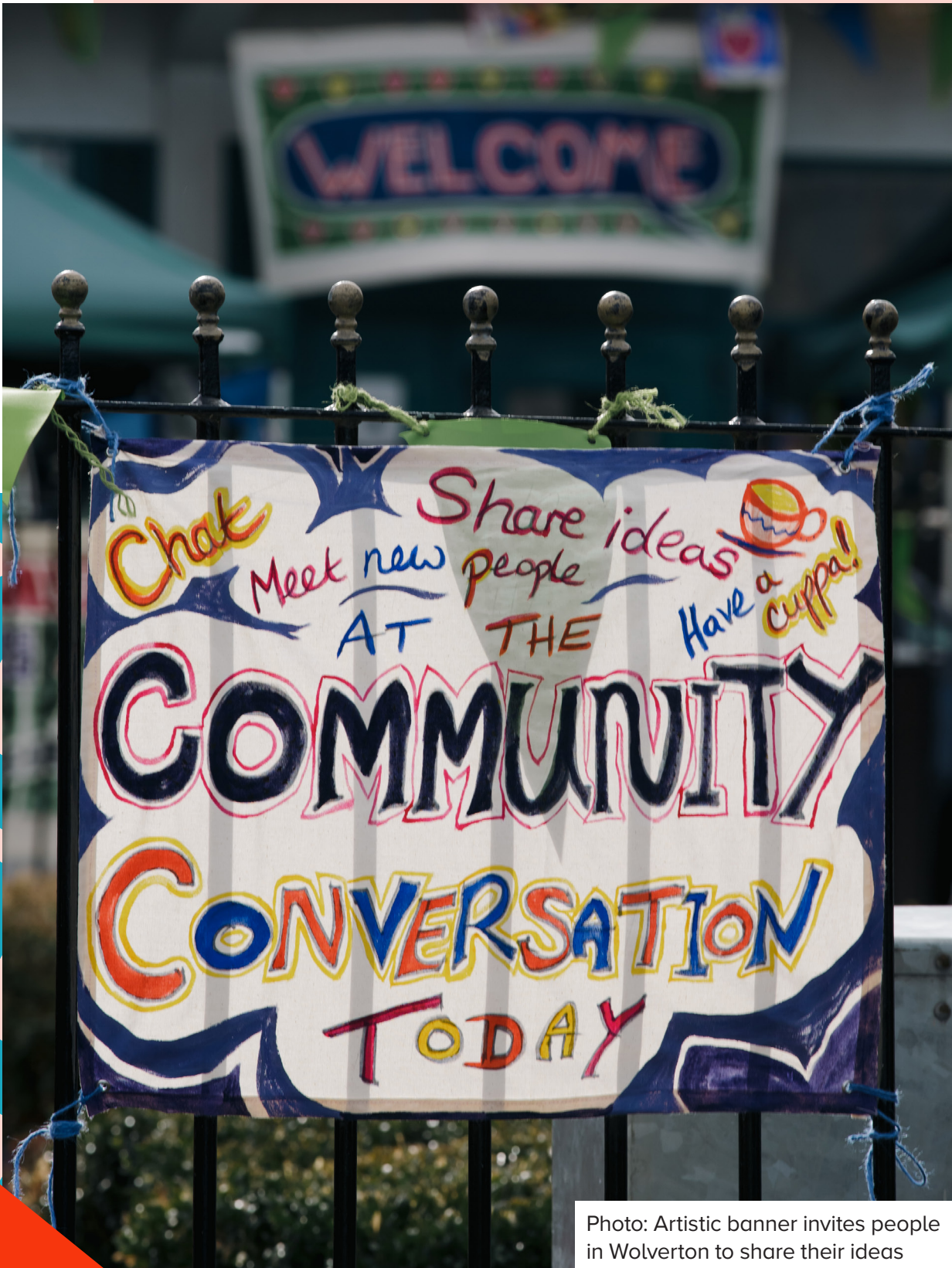
Photo: Artistic banner invites people in Wolverton to share their ideas