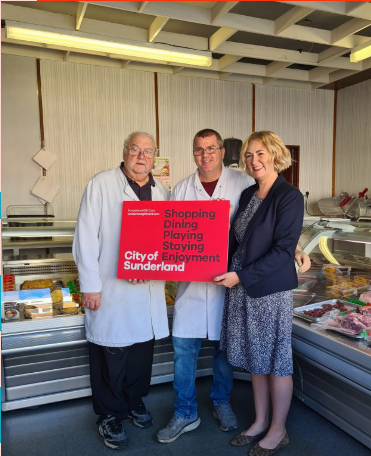
Photo: In Hendon, traders joined a gift card scheme for the city - which brought an additional £9,000 of trade to the street