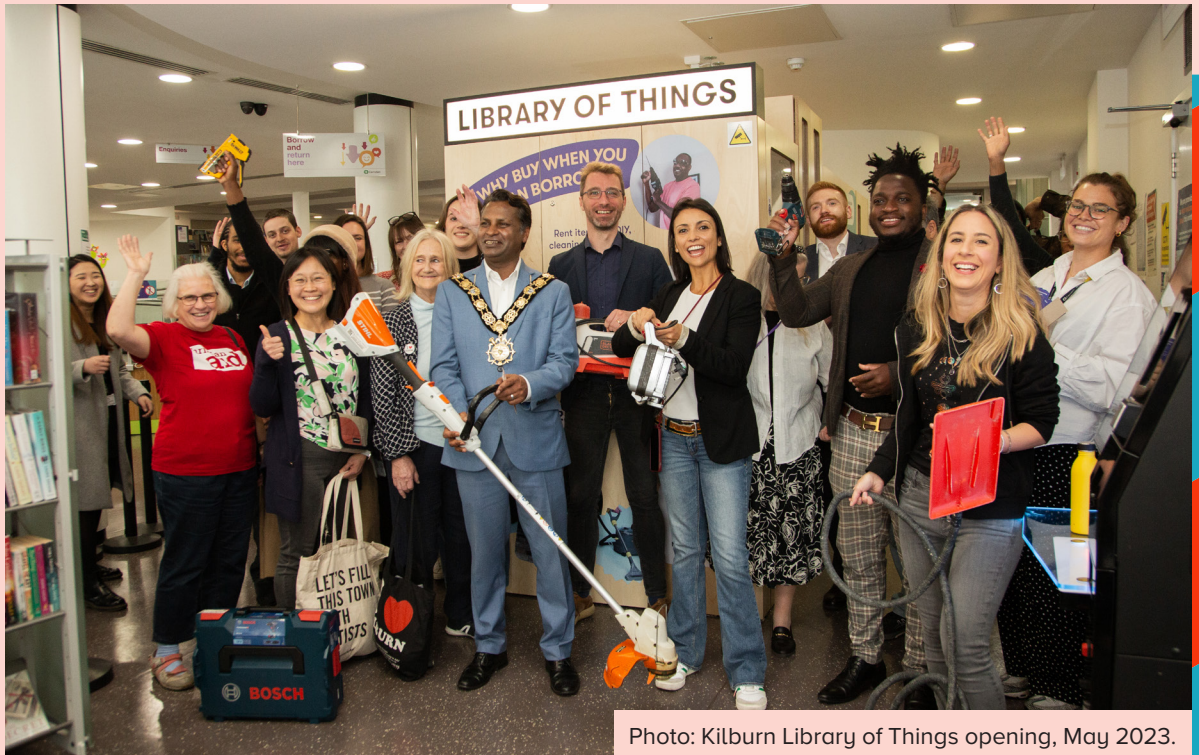
Photo: Kilburn Library of Things opening, May 2023.

The pilot Community Improvement Districts (CIDs) programme in England took place between May 2022 and June 2023 across seven locations. Two high streets in London (Wood Green and Kilburn High Road) received £20,000 grants from Power to Change and £20,000 from the Mayor of London. A further five locations outside London (Hendon in Sunderland; Ipswich; Skelmersdale; Stretford in Greater Manchester; and Wolverton in Milton Keynes) each received £20,000 from Power to Change. The Centre for Regional Economic and Social Research at Sheffield Hallam University and Shared Assets CIC acted as learning partners for the programme.