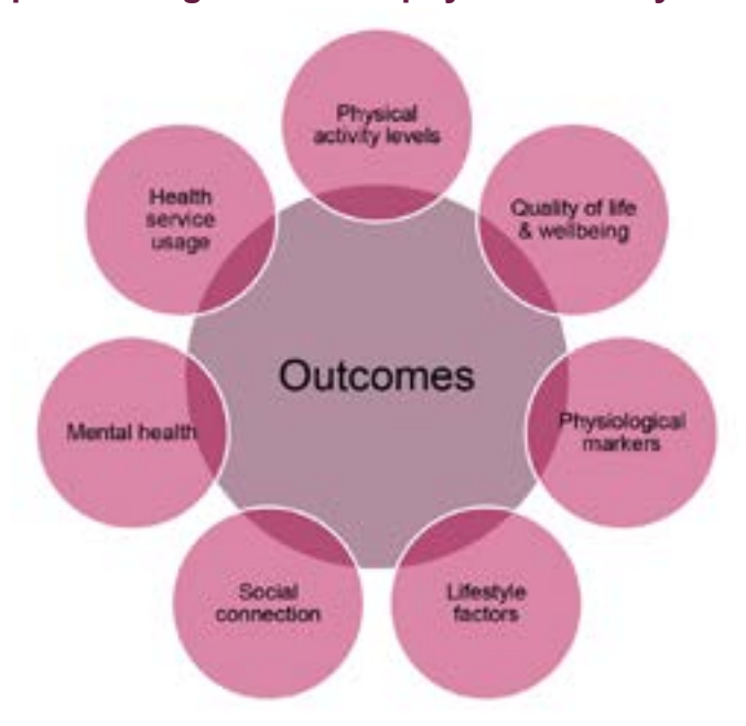
Figure 1: Outcomes associated with a social prescribing referral for physical activity

as physical activity. Despite the limited number of studies, they do provide some indicators about the types of outcomes that can be associated with social prescribing referral to physical activity (Figure 1). Importantly, the findings of a number of studies suggest that a social prescribing referral can lead to increases in levels of physical activities but a lot more evidence is still needed on this and other outcomes.