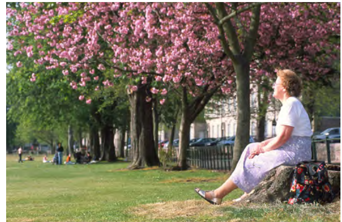
Pittencrieff Park, Dunfermline