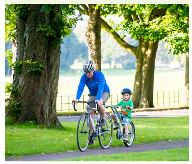
Towneley Park, Burnley

The World Health Organization defines health as 'a state of complete physical, mental, and social wellbeing and not merely the absence of disease or infirmity'. Mental health is defined as a state of wellbeing in which 'every individual realises his or her own potential, can cope with the normal stresses of life, can work productively and fruitfully, and is able to make a contribution to her or his community'. In this review we use 'health' to encompass physical health benefits and 'wellbeing' to refer to mental health, recognising the interconnectedness of the two concepts.