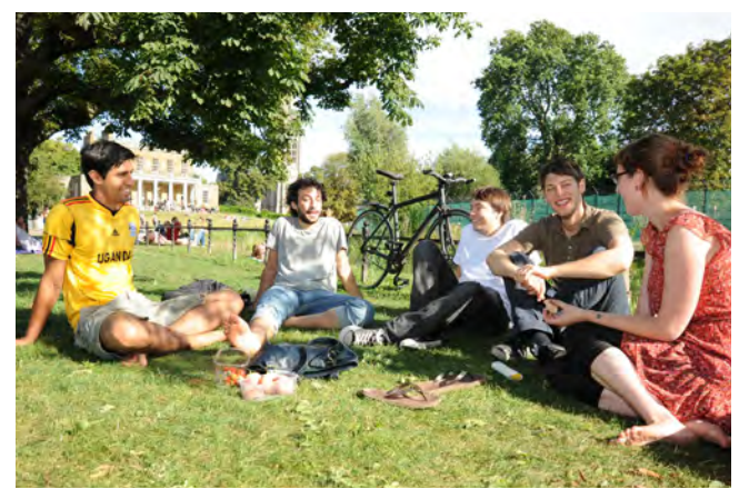
Clissold Park, London