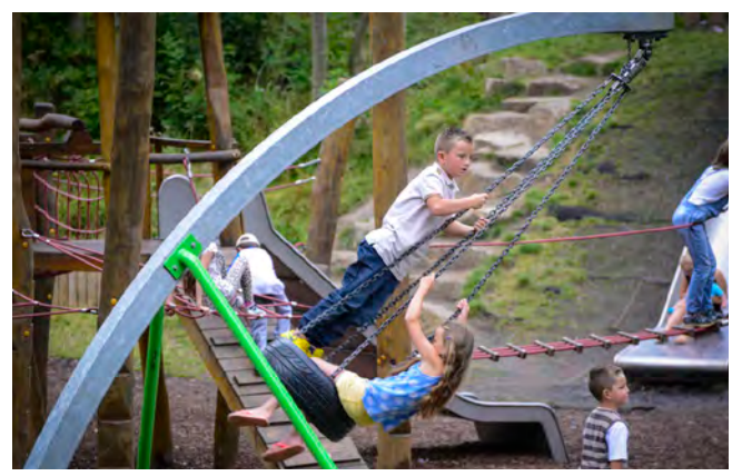
Barnes Park, Sunderland

Playgrounds, unsurprisingly, are linked with increased physical activity among children (McCormack et al., 2010; Jenkins et al., 2014;