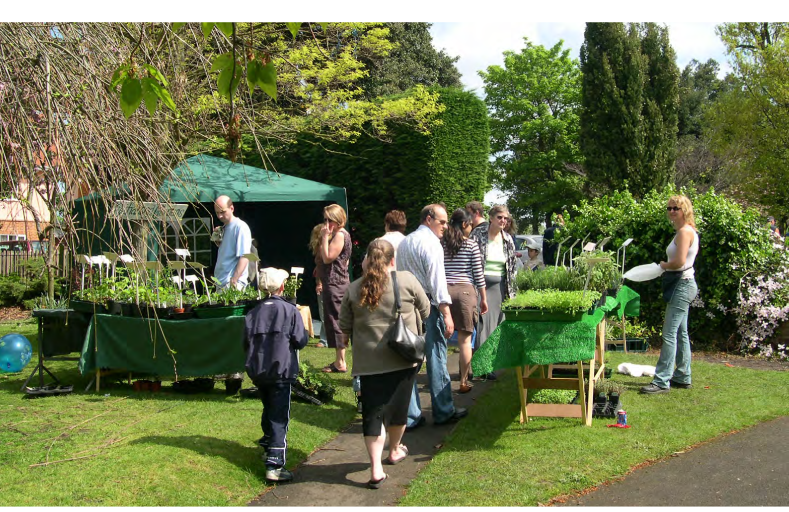
Whitstable Castle Park, Whitstable

The evidence is presented within a context of increasing policy interest in the social benefits of parks and green spaces. Following work by The National Lottery Heritage Fund, the National Lottery Community Fund and civil society organisations, there is growing political recognition of the social importance of public parks. This has been recognised in, for example, the Loneliness Strategy announced by the Government in October 2018, and in work by NHS England on creating healthy new towns.