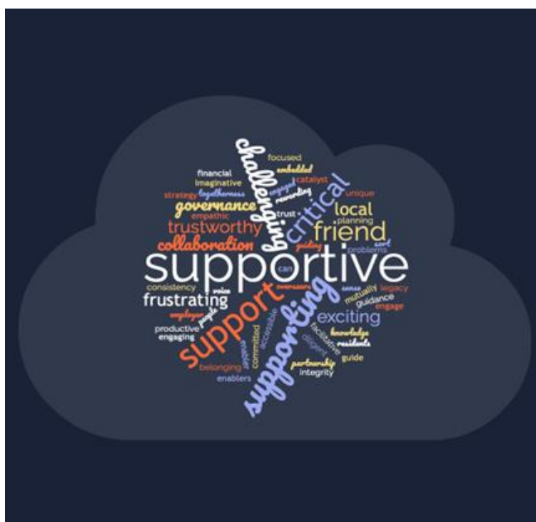
Figure 1. Views of the role of LTOs expressed by workshop participants

While the experiences of each Big Local partnership and LTO are individual and specific to their location and history, our research revealed an overriding view that LTOs provide valued support to resident-led partnerships. In three of our workshops, we asked participants to sum up the role of LTOs in three words. The word-cloud below (Figure 1) illustrates their views. Expressions used include "critical friend", "trustworthy" and "engaging" – but some also found the relationship "frustrating" and "challenging".