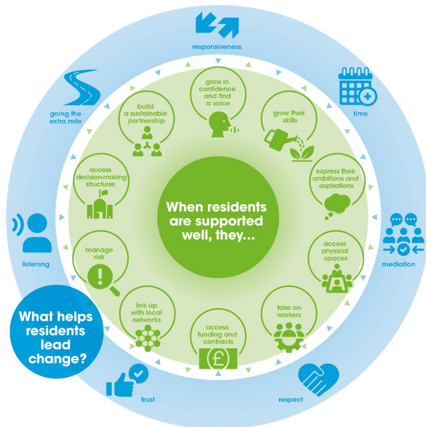
Figure 3. How supporting residents inspires community-led change

On the outer circle are the behaviours that enable LTOs to provide the types of support shown in the inner circle. While the inner circle shows what happens when LTOs support residents effectively, the outer circle highlights how those relationships can be nurtured.