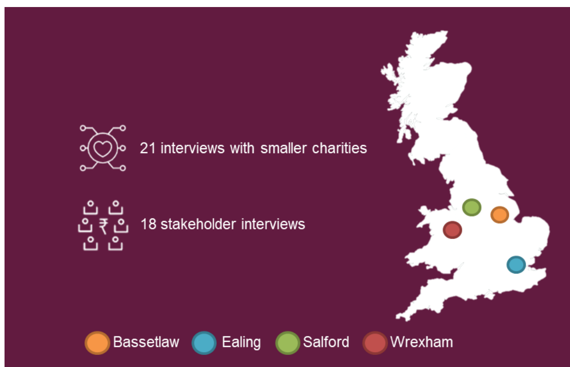
Figure 1: An overview of the case study areas and research undertaken

Research fieldwork took place between August and October 2020 and focussed on the initial period of lockdown between March-June 2020, and the subsequent period (July-September 2020) during which society began to ‘reopen’. It builds on the local relationships and understanding developed during the original study by revisiting the four case study areas – Bassetlaw, Ealing, Salford and Wrexham – and as many of the original participants as possible, to capture rich qualitative insights about how individual smaller charities and the sector as a whole responded to the crisis and how this was experienced by local stakeholders . Overall, 39 people participated in the research, including 21 representatives of smaller charities and 18 stakeholders from the wider public and voluntary sectors in each area (figure 1).