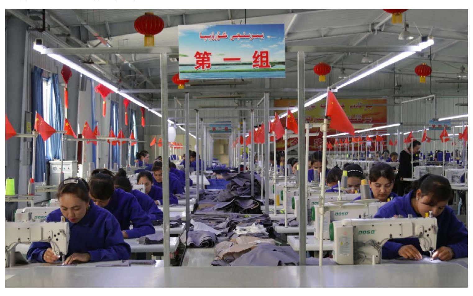
Uyghur women work in apparel factory.

The PRC claims that these labor transfer programs are part of a national campaign for "poverty alleviation." However, the programs involving Uyghurs and other minoritized citizens operate differently from other "poverty alleviation" programs throughout China, because for individuals from the Uyghur Region, the constant threat of internment makes refusing the state-sponsored work placement impossible. Labor transfers are deployed in the Uyghur Region within an environment of unprecedented fear and coercion. Refusal to participate in any government programs, such as labor transfers, for reasons perceived to be religious in any way, is viewed as equivalent to aligning oneself with the three evils - separatism, terrorism, and religious extremism and thus anyone who refuses to work or attempts to walk away from their job, risks internment or imprisonment. Therefore, the programs are tantamount to the forcible transfer of populations, forced labor, human trafficking, and enslavement by international definitions and protocols.