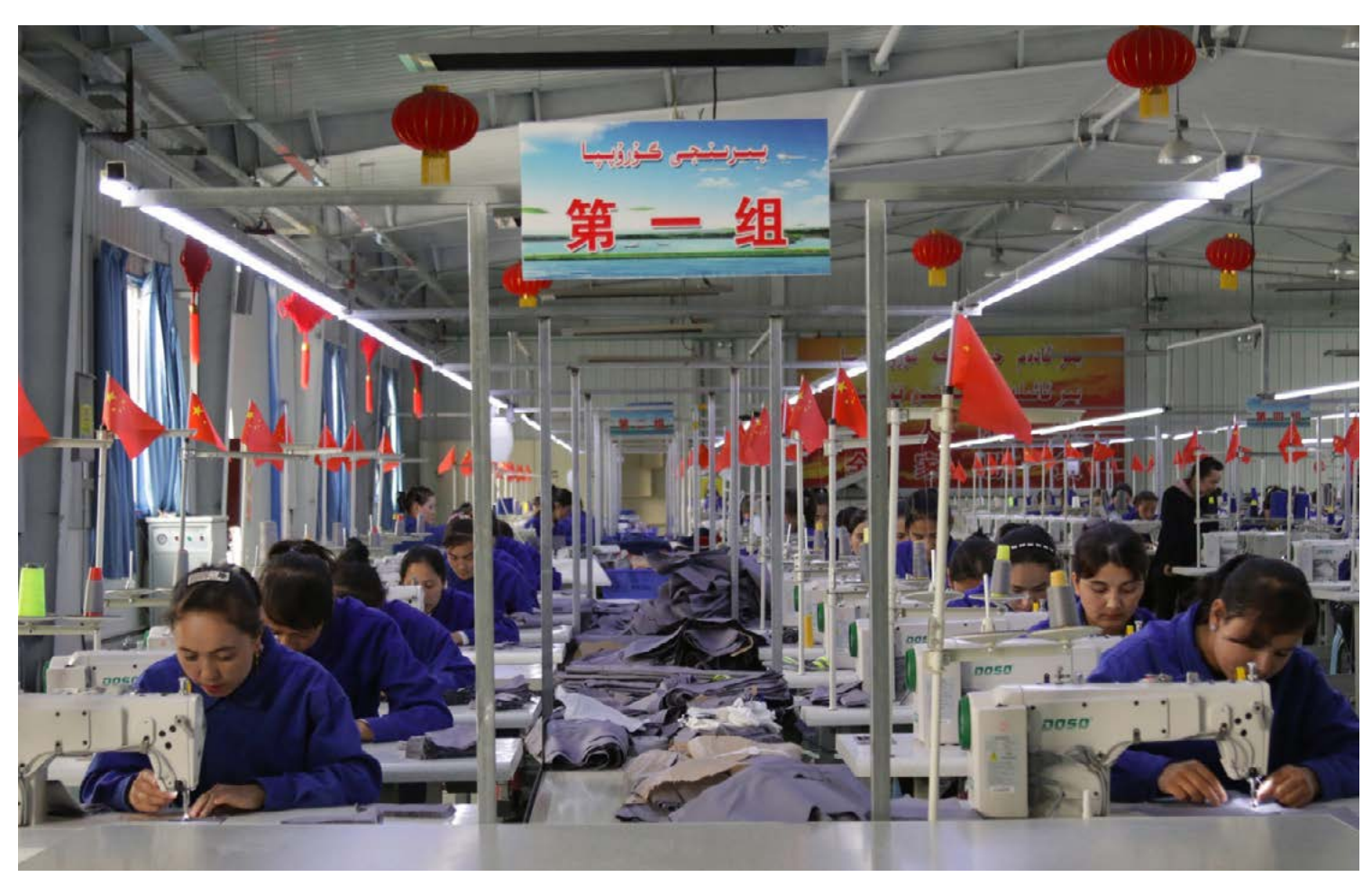
Uyghur women work in apparel factory.

The PRC claims that these labor transfer programs are part of a national campaign for "poverty alleviation." However, the programs involving Uyghurs and other minoritized citizens operate differently from other "poverty alleviation" programs throughout China, because for individuals from the Uyghur Region, the constant threat of internment makes refusing the state-sponsored work placement impossible. Labor transfers are deployed in the Uyghur Region within an environment of unprecedented fear and coercion. Refusal to participate in any government programs, such as labor transfers, for reasons perceived to be religious in any way, is viewed as equivalent to aligning oneself with the three evils - separatism, terrorism, and religious extremism and thus anyone who refuses to work or attempts to walk away from their job, risks internment or imprisonment. Therefore, the programs are tantamount to the forcible transfer of populations, forced labor, human trafficking, and enslavement by international definitions and protocols.