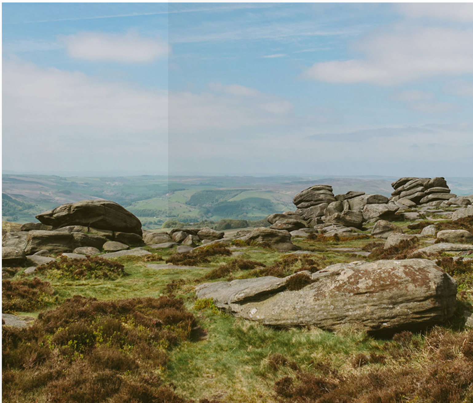
One third of the city of Sheffield lies within the beautiful countryside of the Peak District National Park

Check that any electrical appliances that you intend to bring with you will work safely on this voltage, and bring adapters to help convert the voltage, if necessary.