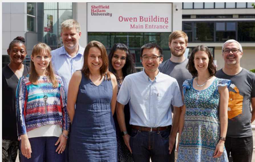
The International Experience Team provide support to all international students in the University.

If you are interested in part-time work, visit Careers Connect for advice and support. Visit shu.ac.uk/current-students/careers-and-employability