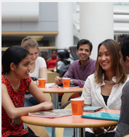
Most halls have a common room where students socialise.