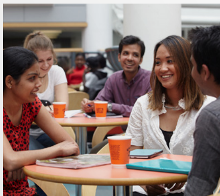
Most halls have a common room where students socialise.