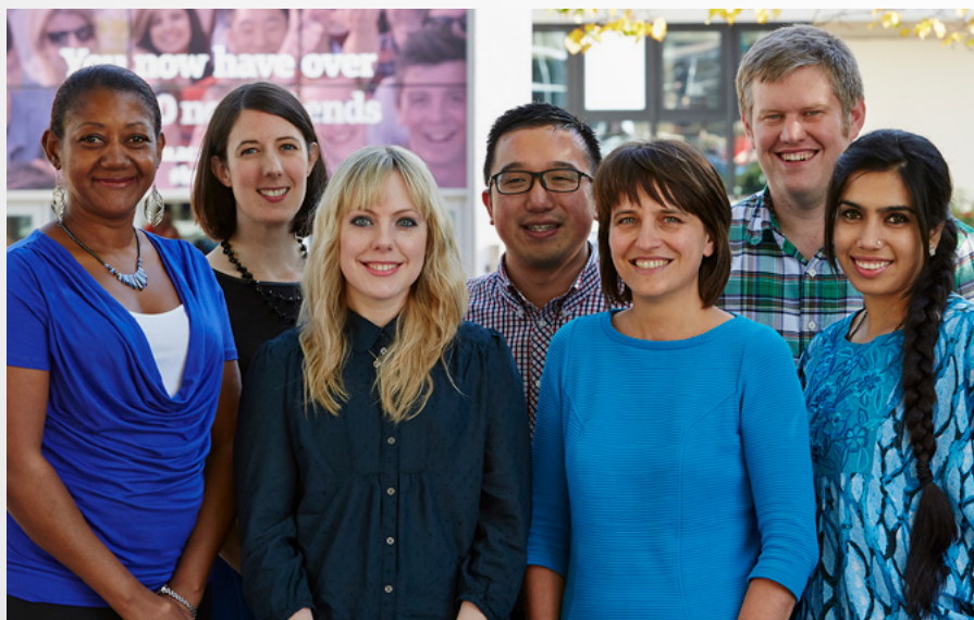
The International Experience Team provide support to all international students in the University.

If you are interested in part-time work, visit Careers Connect for advice and support. Visit shu.ac.uk/current-students/careers-and-employability