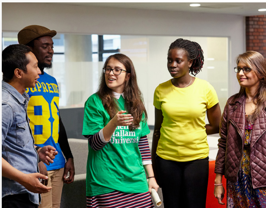
An international student ambassador taking students on a campus tour during Welcome Week.